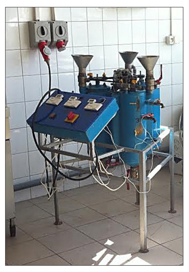
Figure 1. Reactors

The amount of biogas was measured daily. Table 3 and Figure 2 show the total amount of produced biogas.